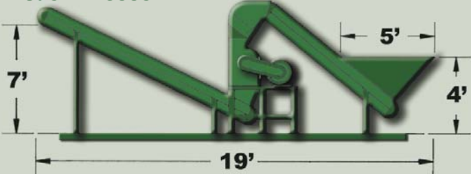
Model # 18850

Brass Casing Deformer also available as a Stationary Expanded Ordnance Casing Deformer